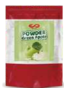
PF-005 Flavor Powder - Green Apple 青蘋果調味粉 Weight: 1kg(2.2lbs) 1kg*20Bags/Carton