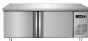
ME-010 Two Temperature Counter 工作檯(含冰箱) Weight: 100kg(220.46lbs) 100kg/Set