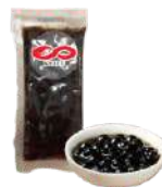
IT-004 Tapioca Pearls - Instant 即食珍珠 Weight: 50g(0.11lbs) 50g*360Bags/Carton