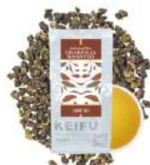
TOO-002 Oolong Tea - Charcoal Roasted 炭焙烏龍茶 Weight: 0.6kg(1.32lbs) 0.6kg*30Bags/Carton