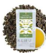
TOO-003 Oolong Tea - Tieguanyin 鐵觀音 Weight: 0.6kg(1.32lbs) 0.6kg*30Bags/Carton