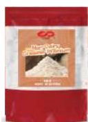
PC-002 Premium Non-Dairy Creamer 頂級奶精 Weight: 1kg(2.2lbs) 1kg*20Bags/Carton