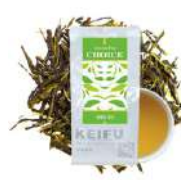
TOG-002 Green Tea - Choice 上選綠茶 Weight: 0.6kg(1.32lbs) 0.6kg*30Bags/Carton