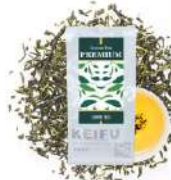
TOG-003 Green Tea - Premium 頂級綠茶 Weight: 0.6kg(1.32lbs) 0.6kg*30Bags/Carton