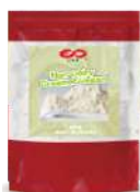
PC-003 Dairy-Free Creamer (Vegan) 素食奶精 Weight: 1kg(2.2lbs) 1kg*20Bags/Carton