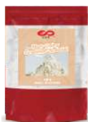
PC-001 Special Non-Dairy Creamer 特級奶精 Weight: 1kg(2.2lbs) 1kg*20Bags/Carton