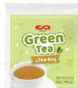
TB-002 Teabag - Green Tea 綠茶免濾包 60g(0.13lbs) 60g*10pcs*30Bags/Carton