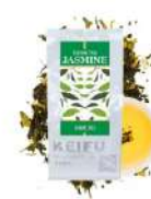
TOG-001 Green Tea - Jasmine 茉莉綠茶 Weight: 0.6kg(1.32lbs) 0.6kg*30Bags/Carton