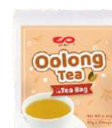
TB-003 Teabag - Oolong Tea 烏龍茶免濾包 60g(0.13lbs) 60g*10pcs*30Bags/Carton