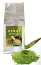
PO-002 Pure Matcha Powder 純抹茶粉 Weight: 1kg(2.2lbs) 1kg/Bag