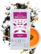
TOB-005 Black Tea - Osmanthus 桂香紅茶 Weight: 0.6kg(1.32lbs) 0.6kg*30Bags/Carton