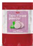
PF-001 Flavor Powder - Taro 芋頭調味粉 Weight: 1kg(2.2lbs) 1kg*20Bags/Carton

Easy to prepare with a smooth texture and rich taste, perfect for high-efficiency drink service.