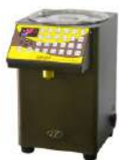
ME-002 Fructose Machine 果糖機 Weight: 9kg(19.84lbs) 9kg/Set