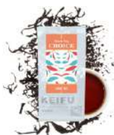
TOB-001 Black Tea - Choice 上選紅茶 Weight: 0.6kg(1.32lbs) 0.6kg*30Bags/Carton