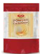
PF-003 Flavor Powder - Cantaloupe 橘哈密瓜調味粉 Weight: 1kg(2.2lbs) 1kg*20Bags/Carton