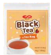
TB-001 Teabag - Black Tea 紅茶免濾包 60g(0.13lbs) 60g*10pcs*30Bags/Carton