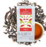
TOB-003 Black Tea - Ceylon 錫蘭紅茶 Weight: 0.6kg(1.32lbs) 0.6kg*30Bags/Carton