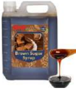
SB-002 Brown Sugar Syrup - Premium for Walling 掛壁黑糖醬 Weight: 5kg(11.02lbs) 5kg*4Bottles/Carton