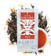
TOB-004 Black Tea - Earl Grey 伯爵紅茶 Weight: 0.6kg(1.32lbs) 0.6kg*30Bags/Carton