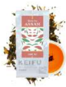
TOB-002 Black Tea - Assam 阿薩姆紅茶 Weight: 0.6kg(1.32lbs) 0.6kg*30Bags/Carton