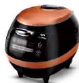
ME-007 Electronic Tapioca Machine (3L) 3公升 珍珠鍋 Weight: 4.8kg(10.58lbs) 4.8kg/Set