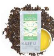
TOO-004 Oolong Tea - Jasmine 茉莉烏龍茶 Weight: 0.6kg(1.32lbs) 0.6kg*30Bags/Carton