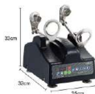
ME-005 Automatic Shaking Machine 雪克機 Weight: 20kg(44.09lbs) 20kg/Set