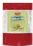
PF-002 Flavor Powder - Honeydew 綠哈密瓜調味粉 Weight: 1kg(2.2lbs) 1kg*20Bags/Carton