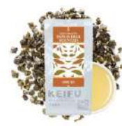
TOO-001 Oolong Tea - Taiwan High Mountain (Light) 臺灣高山青 Weight: 0.6kg(1.32lbs) 0.6kg*30Bags/Carton