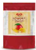
PF-004 Flavor Powder - Mango 芒果調味粉 Weight: 1kg(2.2lbs) 1kg*20Bags/Carton