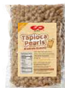
IT-005 Tapioca Pearls - Quickly Cook 快煮珍珠 Weight: 2kg(4.41lbs) 2kg*8Bags/Carton