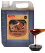
SB-001 Brown Sugar Syrup - Standard 標準黑糖醬 Weight: 5kg(11.02lbs) 5kg*4Bottles/Carton